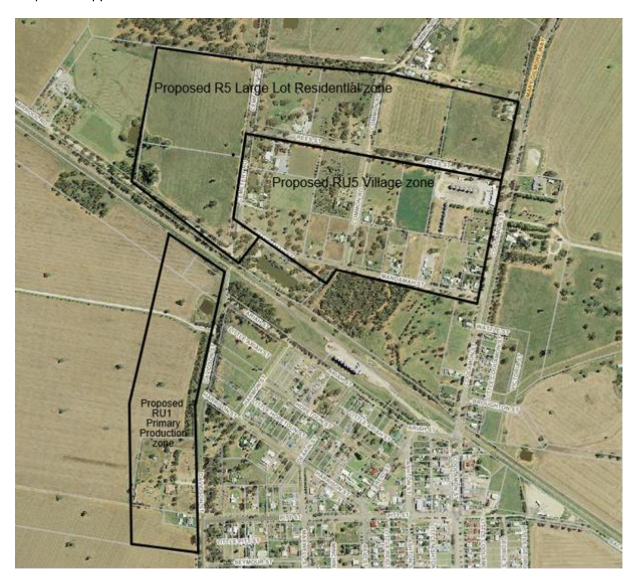
Figure 1: Aerial image of the applicable land area in Ariah Park village, with proposed zoning indicated